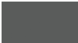
SLATE GRAY SRI: 30