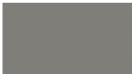
OLD ZINC GRAY SRI: 40