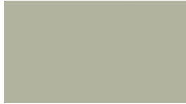
PARCHMENT SRI: 58