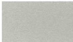
SILVER METALLIC* SRI: 58