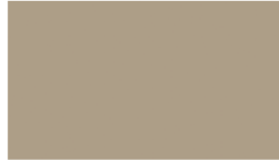
SIERRA TAN SRI: 58