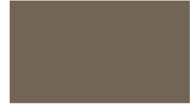
MOCHA SRI: 35