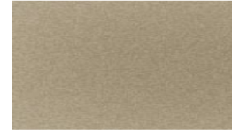
CHAMPAGNE METALLIC* SRI: 49