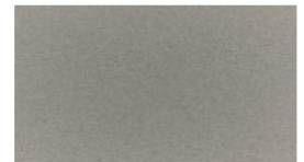
WEATHERED ZINC* SRI: 40