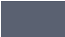
TWILIGHT BLUE SRI: 25